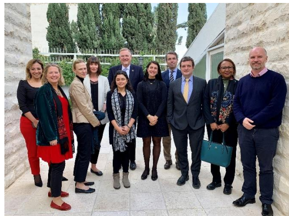
Roundtable discussions together with the Folke Bernadotte Academy (FBA) on advancing the YPS agenda.

Another roundtable discussion was held with representatives from the UN, the EU and donor community, to discuss issues related to the implementation of the Agenda for Youth, Peace, and Security (YPS) in the MENA region. The discussion focused on the need for collaborative efforts in advancing agendas on peace and development and on ways to contribute to better youth inclusion. Challenges that were highlighted included the existing intergenerational gap and lack of opportunities and spaces for dialogue between generations, where young people are often not involved in the policy and decision-making processes.