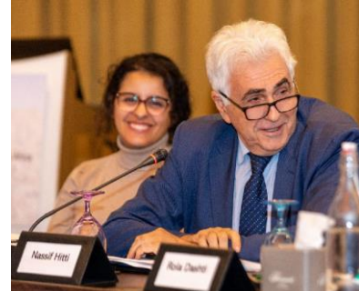
Engaging discussions in the Regional Forum on Inclusivity in Peace and security, November 2022.