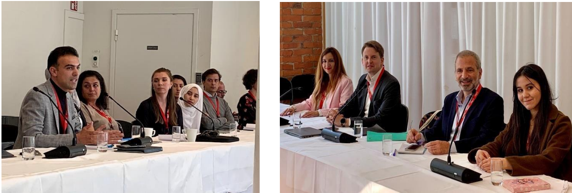
Panels on inclusivity in addressing the climate agenda at Stockholm Forum on Peace and Development.

For more information see: Round table - Creating inclusive processes to address climate change.