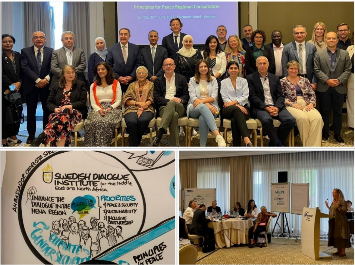
Regional workshop on peacebuilding in collaboration between the Dialogue Institute and Principles for Peace.

For more information see the Institute’s website: Regional Workshop on Peacebuilding - Sweden Abroad and a highlight report .