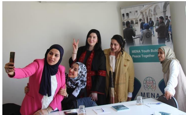
Meeting with the MENA Coalition for Youth, Peace and Security.