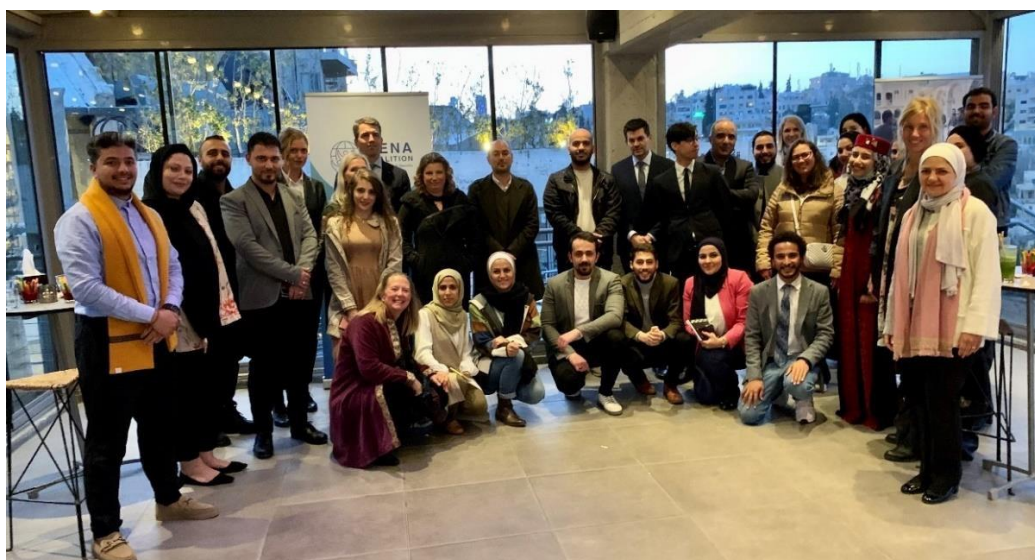
Networking event with the MENA Coalition for Youth, Peace and Security.

During the spring discussions have also been held with different Swedish actors, incl. the Swedish Ministry for Foreign Affairs, the Folke Bernadotte Academy (FBA) – the Swedish agency for peace, security and development – and the Swedish International Development Cooperation Agency (Sida) on how Sweden can continue to support young peacebuilders in the MENA region. The Dialogue Institute also hosted a meeting with the MENA Coalition on Youth, Peace & Security and Swedish civil society organisations, working in the MENA region.