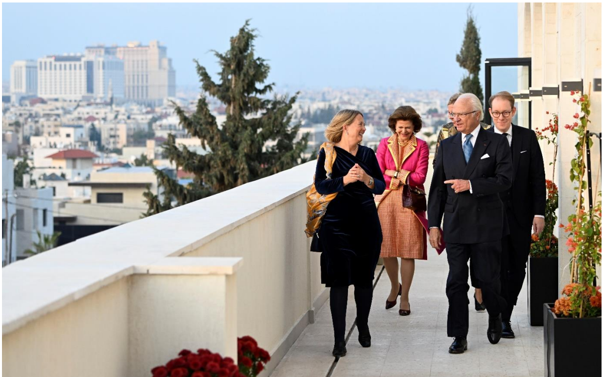
Their Majesties King Carl XVI Gustaf and Queen Silvia and H.E. Foreign Minister Billström at the inauguration.

Other key areas that the Institute has continued to work on has included dialogues on peace building, and on the agendas for Women, Peace and Security (WPS) and for Youth Peace and Security (YPS). The Institute has also continued its work on youth participation, gender equality and questions related to democratic development and freedom of expression.