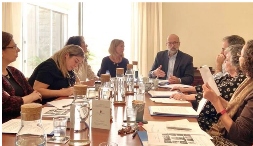
The first meeting of the Dialogue Institute's Advisory Committee.

The meeting served as an occasion for the Advisory Committee to become more familiar with the work and vision of the Institute, for teambuilding and exchanges, and for the Institute to get valuable input for its future work plan. The discussions covered insights regarding regional trends and development, as well as advice on target groups, areas of work and working methods. The meeting was attended by most members of the Dialogue Institute's eminent Advisory Committee. For more information about the meeting, see the full report .