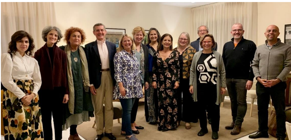
Roundtable meeting on culture and dialogue in Amman, December 2022.